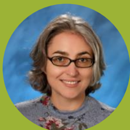
Sara Knee Art